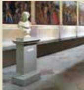
Mantegna Gallery 200 Reception