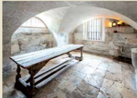
Royal Kitchens 60 Reception 24 Dinner