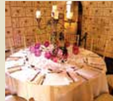
St Thomas's Tower 40 Reception 20 Dinner