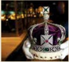
Jewel House 150 Reception