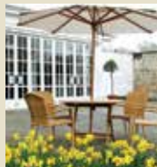
Garden Room 300 Reception 220 Lunch, Dinner, Dancing 250 Theatre style