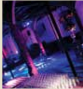
The Undercroft 250 Reception 180 Dinner 220 Dancing