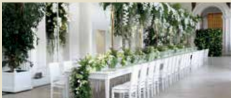
The Orangery 300 Reception (570 with terrace marquee) 200 Dinner and lunch 120 Dinner with dancing 200 Theatre style 120 Cabaret style