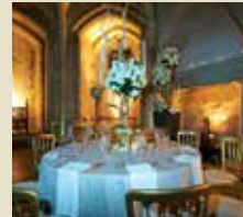
Wakefield Tower 80 Reception 40 Dinner