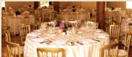
New Armouries: Banqueting suite 300 Reception 240 Dinner 150 Lunch