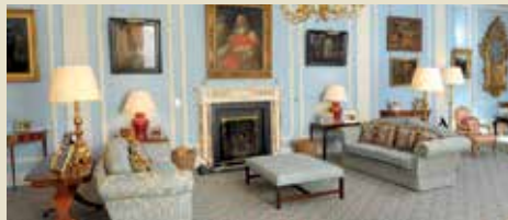
State Drawing Room 110 Reception 40 Theatre style