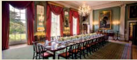
State Dining Room 70 Reception 50 Dinner