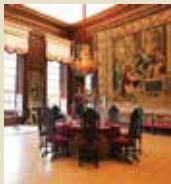
The Kings Eating Room 60 Reception 40 Dinner 24 Reception and dinner