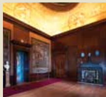
Privy Chamber 70 Reception 40 Dinner