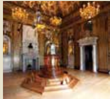
Cupola Room 100 Reception 80 Dinner