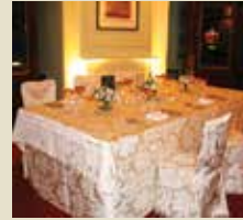
Martin Tower 12 Dinner