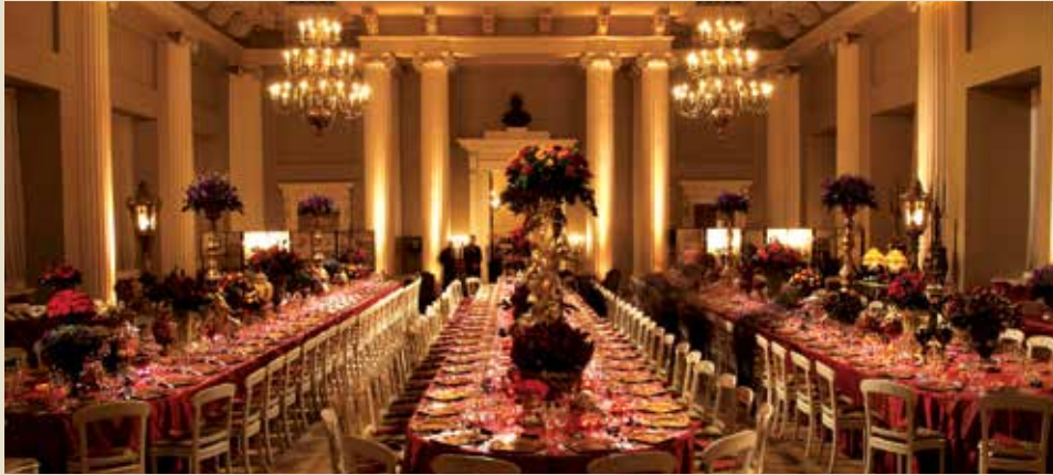
Main Hall 500 Reception 380 Dinner