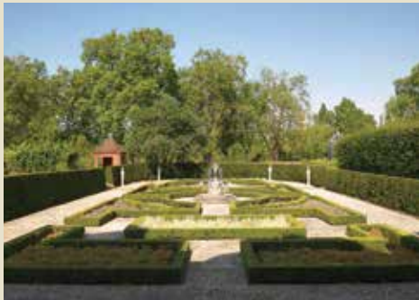
Queen's Garden 40 Reception