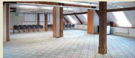
New Armouries: Meeting suite 100 meeting suite 16 Boardroom 6 Syndicate room