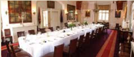
Royal Regiment of Fusiliers 80 Reception 70 Dinner