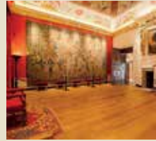
Kings Presence Chamber 20 Reception 14 Dinner