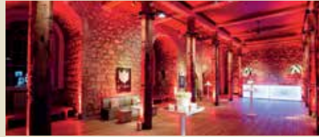
White Tower 250 Reception 90 Dinner