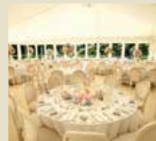
Marquee 400 Theatre 350 Dinner 350 Reception