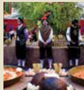
Marquees: Palace courtyards 1,200 Reception 600 Dinner 360 Dinner and dancing