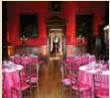
King's Drawing Room 90 Reception 90 Dinner