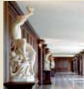
Orangery and Privy Garden 250 Reception 150 Dinner