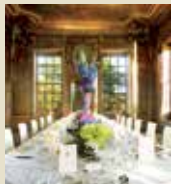
Little Banqueting House 80 Reception 50 Lunch, Dinner