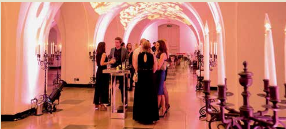
The Undercroft 380 Reception 120 Dinner

Revolutionary, theatrical, dazzling, versatile venues to suit any occasion.