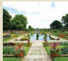
Sunken Garden 80 Reception