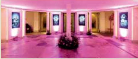
Entrance Hall 300 Reception 140 Dinner