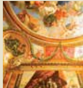
Queen's Drawing Room 150 Reception 80 Dinner