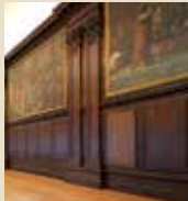
Cartoon Gallery 300 Reception 200 Dinner