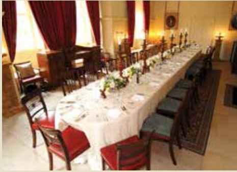
King's Dining Room 40 Reception 30 Dinner