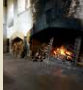
Tudor Kitchens 150 Reception 100 Dinner