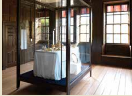
King's Breakfast Room 24 Reception