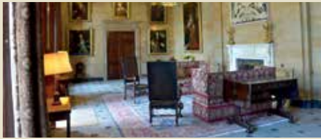
State Entrance / Candlestick Hall 40 Reception 20 Dinner