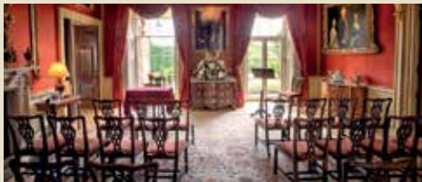
Red Room 30 Reception 10 Dinner