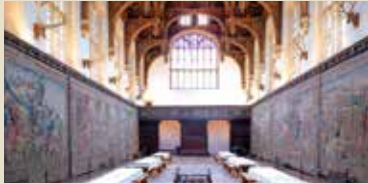
Great Hall 400 Reception 270 Dinner