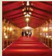
Marquees: Palace grounds 3,000 Reception 1,500 Dinner 1,000 Dinner and dancing