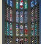
Great Watching Chamber 150 Reception 100 Dinner