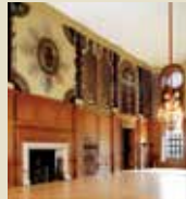
King's Guard Chamber 200 Reception 150 Dinner