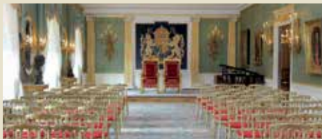
Throne Room 150 Reception 130 Theatre style 90 Dinner