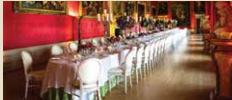
King's Gallery 170 Reception 110 Dinner 170 Recitals (200 without stage)