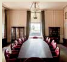
Privy Council Chamber 25 Theatre Style 12 Boardroom