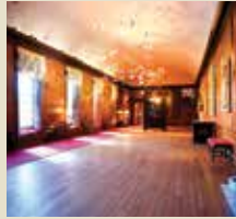
Queen's Gallery 170 Reception 70 Dinner